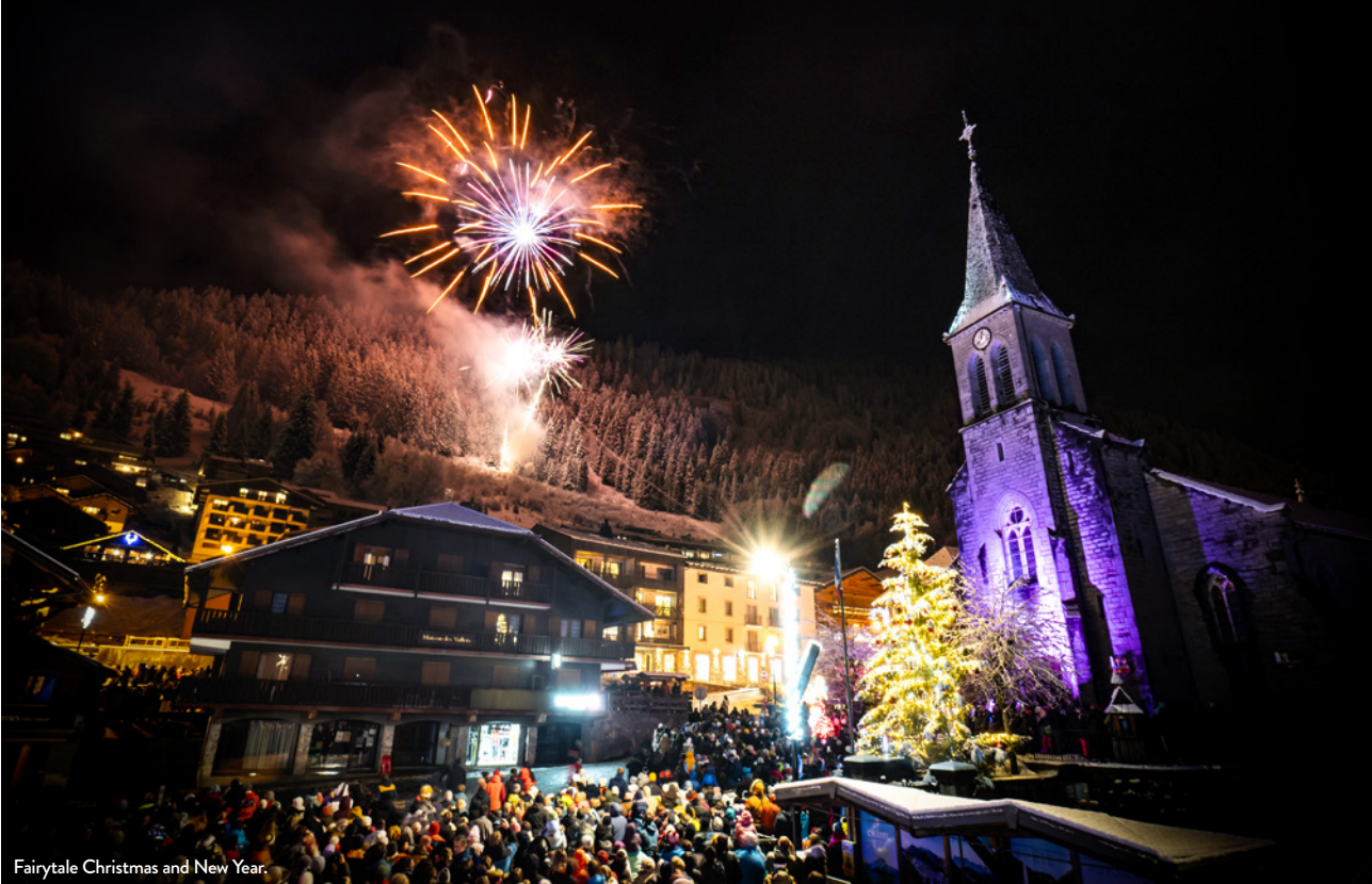
Fairytale Christmas and New Year.