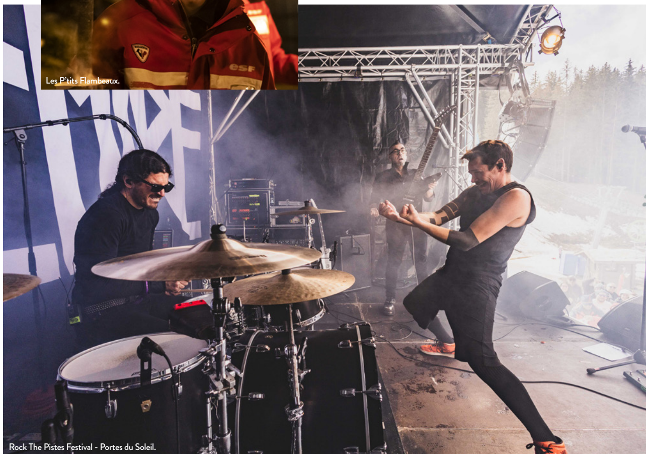
Rock The Pistes Festival - Portes du Soleil.