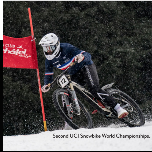
Second UCI Snowbike World Championships.