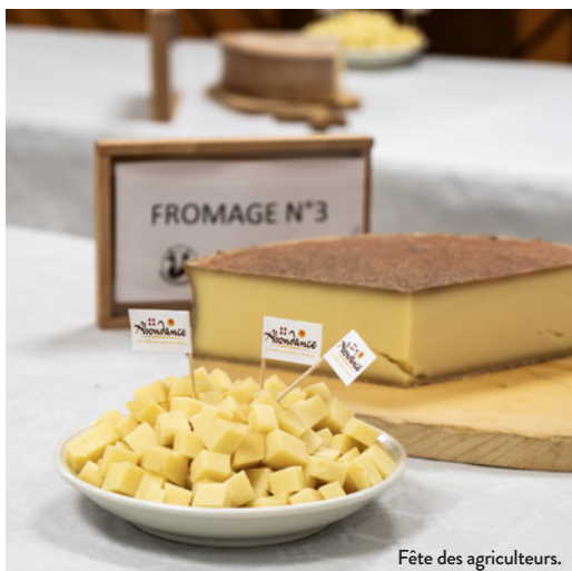
Fête des agriculteurs.